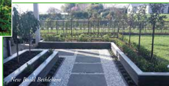
New Build Bethlehem