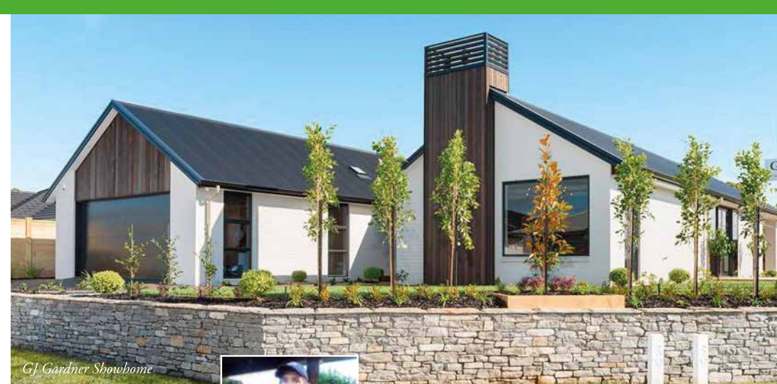
GJ Gardner Showhome

Hamish Brooks Landscapes is experienced in various garden styles that will add value and impact to your property, including formal gardens, contemporary-designed outdoor areas, small gardens, tropical design, landscaping for