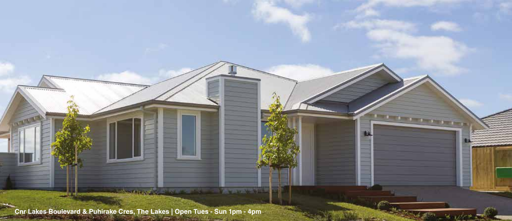
Cnr Lakes Boulevard & Puhirake Cres, The Lakes | Open Tues - Sun 1pm - 4pm